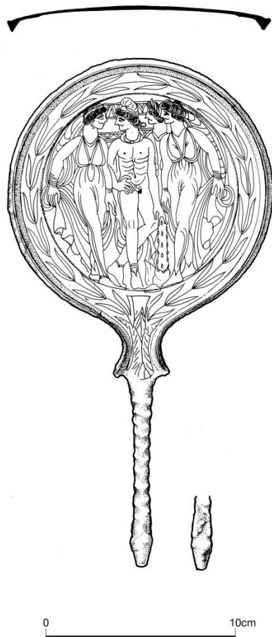
Fig.7. A mirror depicting the Judgement of Elscntre/Paris. A popular Etruscan image of Turan.

Greek ceramics painted with mythical scenes had been imported into Etruria since the eighth century, their designs imitated by both local and immigrant Greek artists. 39 It is not certain whether the Etruscans received Greek myths purely through such images or if they had any knowledge of the texts of the Iliad and Odyssey . 40 Lowenstam argues for a milieu in which different versions of the myths (oral, visual and written) circulated and interacted upon each other. 41 The Etruscans only depicted a selection of the available Greek myths and