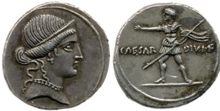
Fig.19. Coin of Octavian before 31 BC, showing Venus and Octavian

One coin shows a portrait head of Octavian on the obverse, with an armed and semi-naked Venus on the reverse and another in the series depicts the head of Venus on the obverse, with the figure of Octavian entering battle on the reverse. 40 Octavian ensured the games which had been vowed by Julius Caesar in honour of the goddess were carried out in 44 BC, during which statues of Caesar and Venus were carried in procession. 41 A comet which appeared on the day of the games was seen as a sign of Caesar's apotheosis, presided over by the goddess, and this sidus Iulium became part of the iconography of the divine Julius. 42 The star as a symbol of divinity had already been associated with Venus on Caesar's own coins. 43