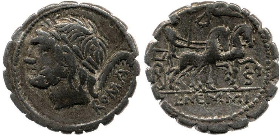
Fig.14. 106 BC coin of Memmian clan with reverse showing Venus driving chariot pulled by horses. Cupid flies above. Obverse depicts Saturn. See similarity to the later coin of Cybele (fig. 12 above).

(as with the Temple of Erycina ) they may often have acted in a representative, rather than a personal capacity.