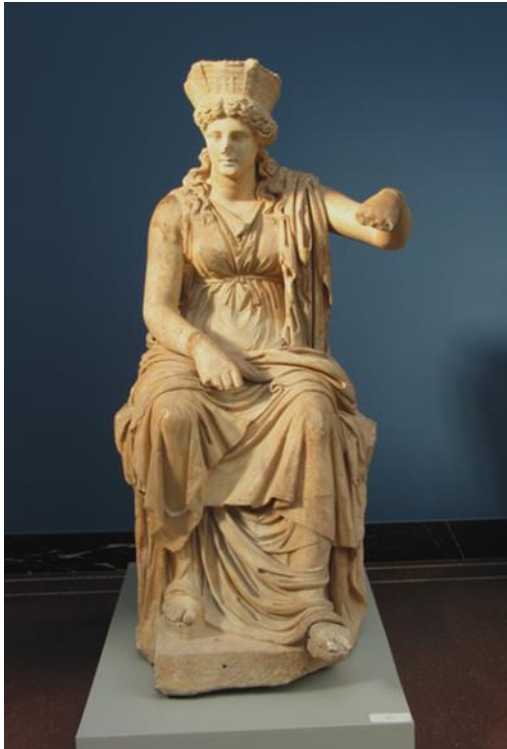
Fig.11. Cybele with turreted crown. She may have originally held a cornucopia. From Formia, Lazio, 1 st century BC

body and her feet on a footstool. She usually wore a low crown, often turreted to represent her status as a protector of cities and was dressed in a long garment, often holding a tympanum and a libation bowl (fig 11). 86