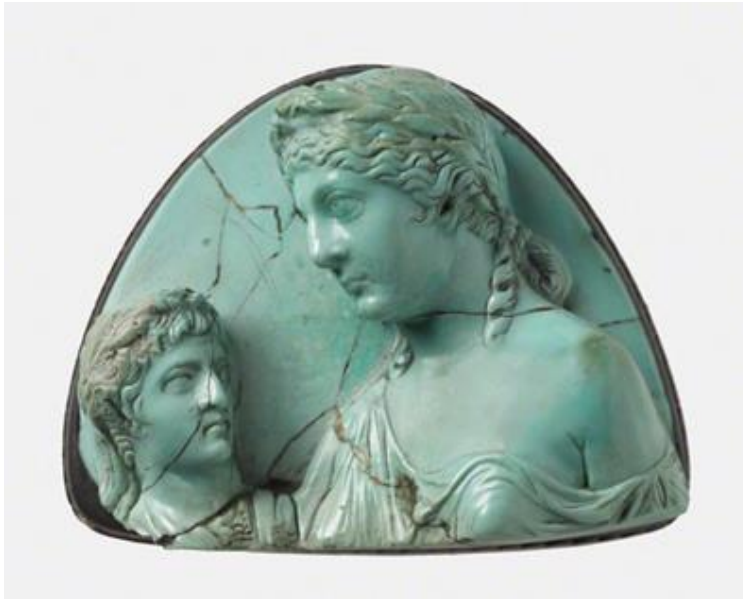
Fig. 22. Gem with Empress Livia depicted as Venus, holding a portrait head of Tiberius 14 – 37 AD.