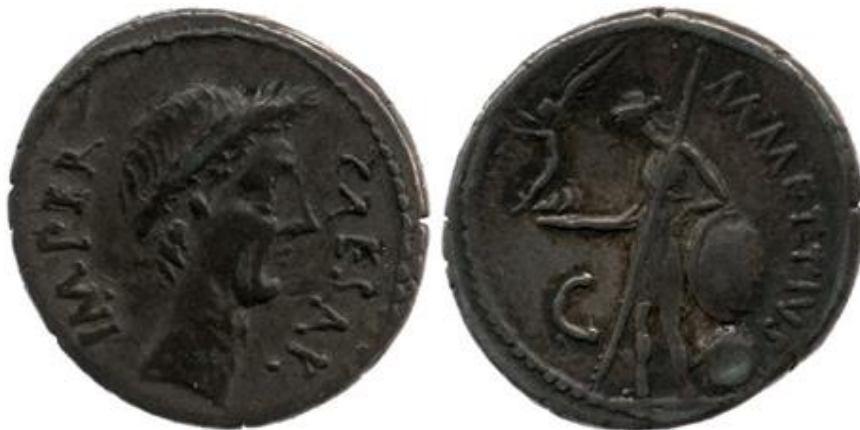
Fig.17. Coin of 46-44 BC, showing Venus bestowing Victory on Caesar

Pliny tells of Julius Caesar dedicating a cuirass made of pearls in the temple ( HN.9.11 ). The object represented gratitude for his conquest of Britannia, but the pearls were particularly appropriate for Venus, who is often shown wearing them. 35 Pliny records that the cult image made for the temple was by the Greek sculptor Arcesilaus, though its appearance is unknown ( HN. 35.156 ). Weinstock suggests the statue may have been of Venus with Cupid on her shoulder or with Victory on her hand, both representations which appeared on coins. 36 Schilling provided no evidence for the new design which he believed was created for the