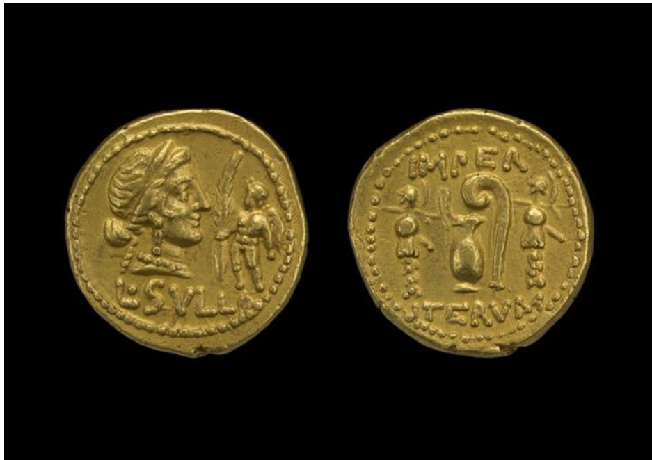
Fig. 15. Coin of Sulla, 84-83 BC

In 84-83 BC Sulla had a coin minted which depicted Venus next to his name (fig.15). 14 The words imper(ium) iterum on the obverse most probably refer to Sulla's victories at Cilicia and Chaeronea. Appian describes how he celebrated the second by erecting two trophies dedicated to Ares, Nike and Aphrodite, whom he believed had brought him success ( B.Civ. 1.97). 15 The inclusion of Aphrodite seems to relate to an oracle recorded by Appian and a dream associated with Sulla in which he saw the armed goddess leading his army. 16