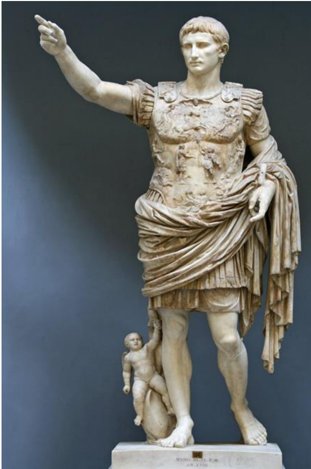
Fig.21. Statue of Augustus with Cupid. Marble copy of a bronze original, after 20 BC

Early in his rule Augustus had banned craftsmen's associations, but by the end of his reign many were re-established as religious cults dedicated to the emperor. Often their shrines included altars to personifications such as Pax or Concordia , honouring the emperor, or to personal gods like Venus now given the epithet Augustus or Augusta . 55 Vows made at these shrines were for the safety of the emperor and of Rome. 56