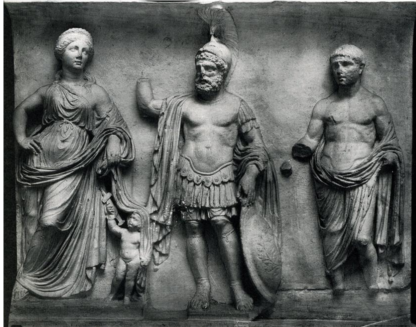
Fig. 25. Augustan relief showing Venus Genetrix, Mars Ultor and an Augustan prince.

the sword of Mars to his mother may sum up the tension between these two characters for Venus, the same tension expressed by the poets. Here however the harmonious and the martial natures are integrated in the service of Augustus who through military force has created peace for Rome (fig. 25). 87