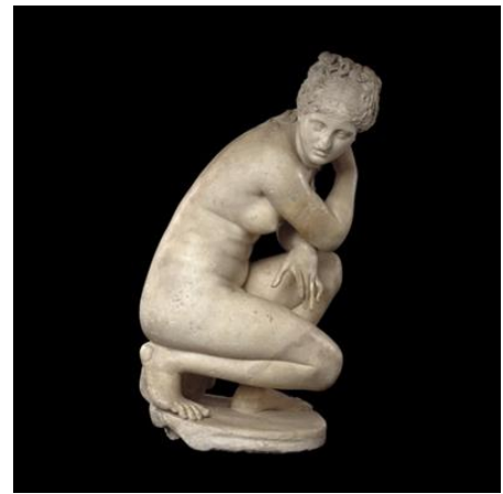
Fig.4. Small Roman copy of a Greek statue of Aphrodite 2 nd century AD