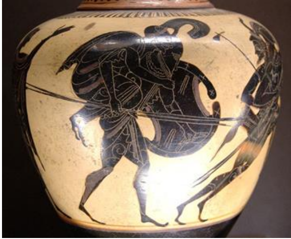
Fig.13. Attic vessel showing Aeneas and Anchises, c.520 BC.

especially popular in Etruria, where a large number of vase paintings show episodes from the Trojan legends. 105