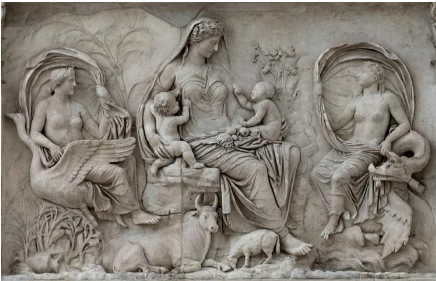
Fig. 23. Relief on the Ara Pacis 13-9 BC

A relief on the Ara Pacis has a figure whose identity has been much disputed, but may represent Venus (fig.23). 61 The garment slipping off her shoulder associates her with other representations of the goddess, and the two babies on