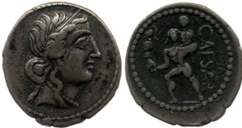
Fig.16. Coin of Julius Caesar, showing Venus and Aeneas 46-44 BC