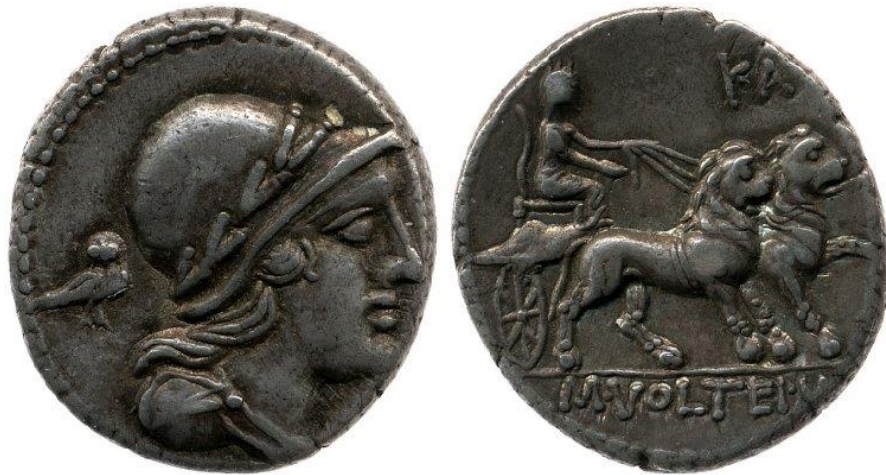
Fig. 12. Roman coin of 78 BC. Obverse shows helmeted bust with laurel wreath. Reverse shows Cybele wearing a turreted crown, holding a patera in her right hand, and driving a chariot drawn by lions.

Those aspects of Cybele which developed after her arrival at Rome are most relevant to the changing character of Venus. The goddess's connections with victory and protection were similar to those of Venus, as evidenced by the similarity in the way they were portrayed on coins (fig. 12 and compare with fig. 14). Both goddesses had arrived in Rome in order to secure the safety of the city and would have an important role as the Romans sought to define their identity in relation to neighbouring peoples. 100 Cybele's role as protector of Rome, like that of Venus, would take on even more significance in the Late Republic. 101