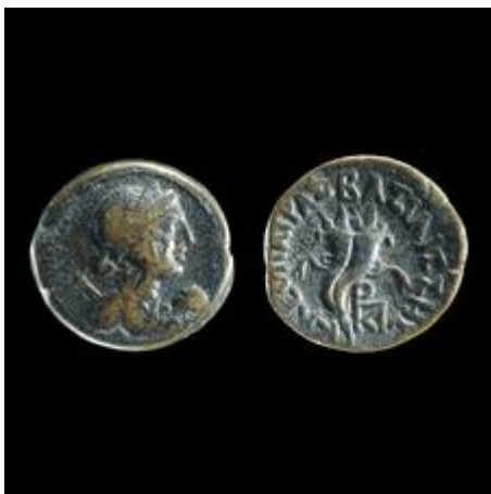
Fig. 20. Cleopatra depicted as Venus with her son Cupid, perhaps dated to 47 BC to celebrate the birth of Caesarion. Bronze coin minted in Cyprus.