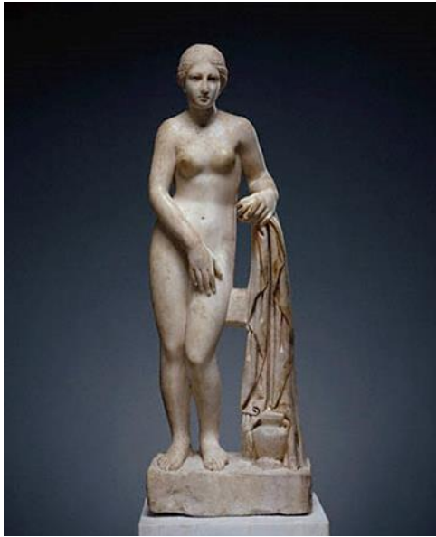
Fig.3. Roman copy of the Aphrodite of Knidos c. 175 AD