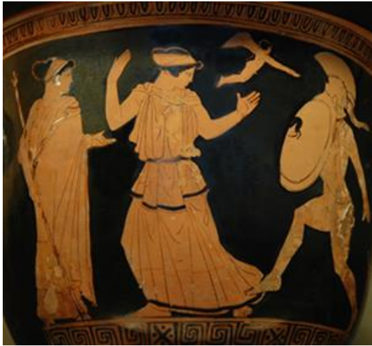
Fig.2. Aphrodite (left) protects Helen from Menelaus, while Eros flies above. Detail from Attic krater, c.450 BC

In the mid-fourth century BC the famous statue of the goddess was carved by Praxiteles for her shrine at Knidos. 19 Probably painted in bright colours, the statue depicted the naked goddess standing, her weight unevenly distributed and leaning on her right leg, and her head turned to the left. Her right hand covered her pubic region, and her left held some drapery. Visitors to the shrine would have seen the goddess as ‘a heavenly apparition of the goddess of love’ unrelated to any particular myth. 20 The statue was much imitated at Rome and throughout the Mediterranean world from the second century BC, often in the form of small statuettes for personal use, until its destruction in 476 AD (fig. 3 below).