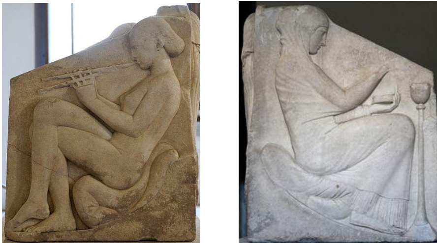
Figs. 5 and 6. Left and right hand reliefs of the Ludovisi Throne Greek c. 460 BC

Aphrodite was served by both male priests and female priestesses, and though women were forbidden from some shrines, there were also ceremonies restricted to women. 23 At Athens, young girls took part in rituals on the eve of their marriage. 24 Cults in a number of Greek cities were connected with prostitution, both that of ordinary working girls and sacred prostitutes. This was especially the case in Greek Corinth whose protector goddess was Aphrodite, and where the worship of prostitutes was seen to be essential to the safety of the city. 25 Dillon suggests that the so-called Ludovisi throne depicts a respectable female citizen and a prostitute, indicating the goddess's dual role as 'goddess of sexuality worshipped by the prostitute, and the deity who brings love to the marriage bed' (figs.5 and 6). 26 This idea of the inclusion of two kinds of women may have influenced Ovid's description of the festival of Verticordia at Rome.