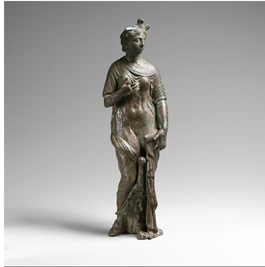
Fig.10. Isis/Tyche wearing vulture cap and holding rudder. Roman c.150 AD

The goddess's cult spread to the island of Delos, where she was also assimilated to Artemis, who had associations with both chastity and childbirth, and reached the towns of Puteoli and Pompeii in Campania on the trade routes to Rome. 73 In the second century Isis/Tyche was worshipped at Praeneste, close to the city. A number of first century decrees at Rome attempted to ban the worship of Isis and destroy her shrines there, but in 43 BC a temple in the city was authorised by Antony, Octavian and Lepidus.