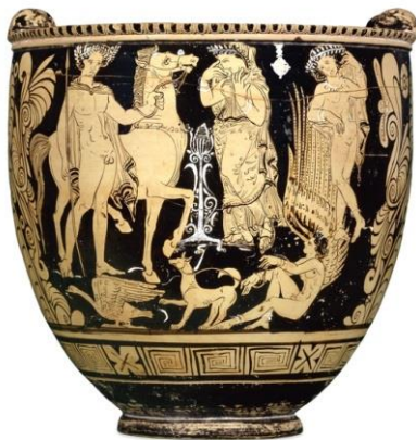
Fig.1. The meeting of Helen and Paris, watched over by Aphrodite. c.350 BC. This vase is from Campania, an area influenced by Etruscan culture, where the story was popular (see page 34 below).

Aphrodite's beauty and erotic powers were frequently illustrated by Greek artists. 16 Her birth was a popular subject; she was shown either emerging as an adult female from the waves or from a shell. 17 The goddess was often shown inciting Helen's flight and adultery, and protecting her from Menelaus, or accompanied by the three Graces (figs. 1 and 2 below). 18