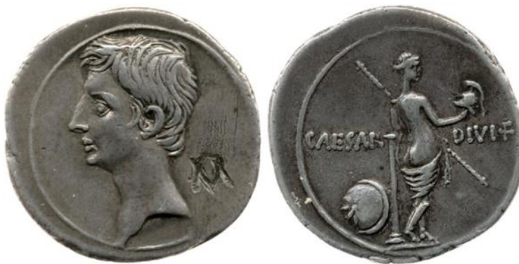
Fig.18. Coins of Octavian before 31 BC, showing Venus and Octavian