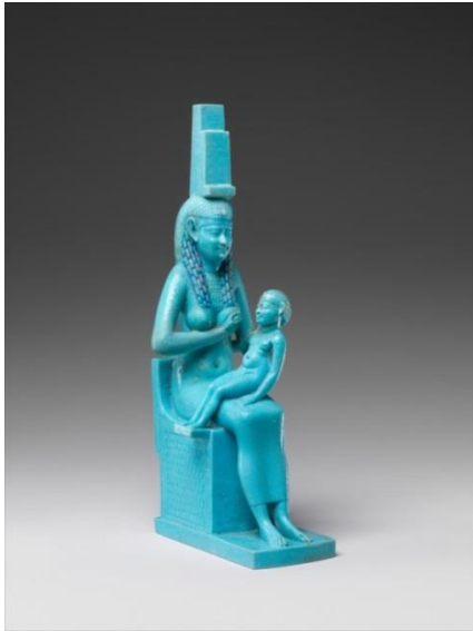
Fig.9. Isis suckling her son Horus. Egyptian, c. 330 BC