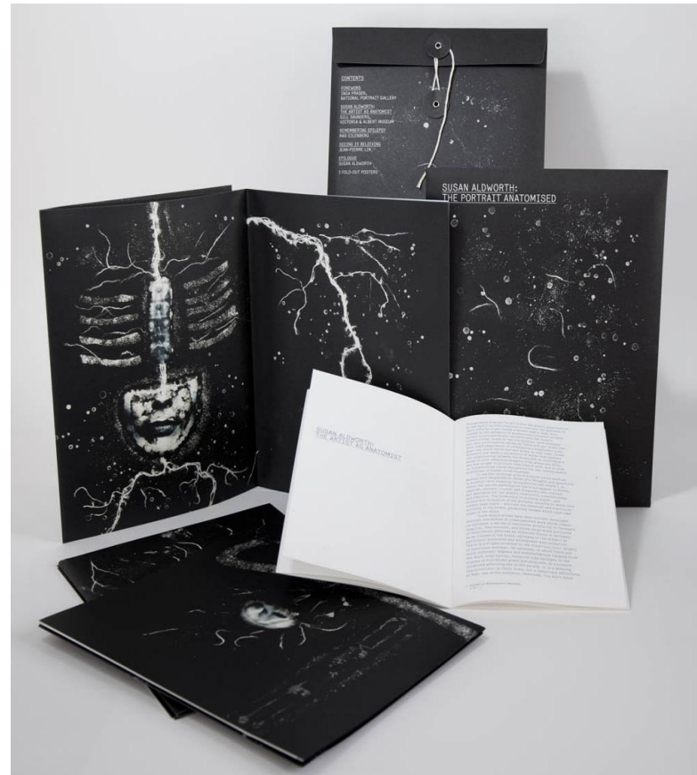
Catalogue for National Portrait Gallery exhibition The Portrait Anatomised