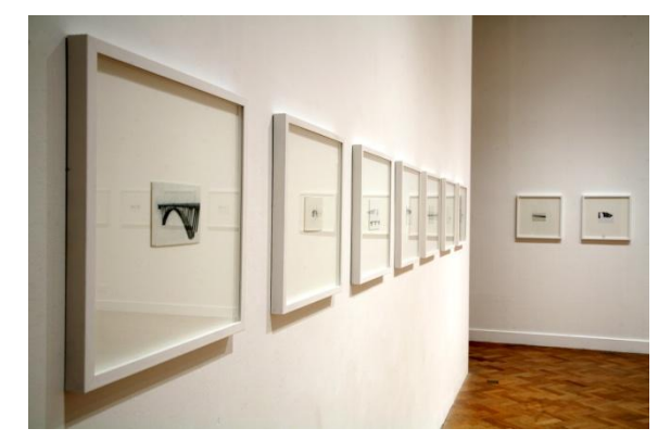
Bridges installation view, Glynn Vivian Gallery, Swansea, 2009