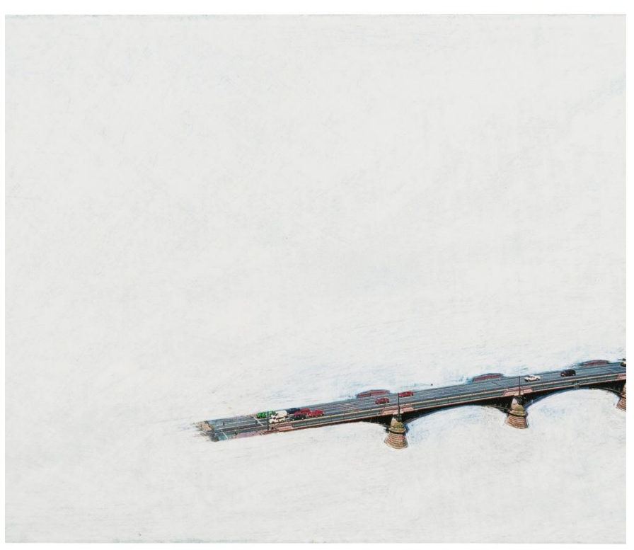
From the Bridges series (both images detail), 2009