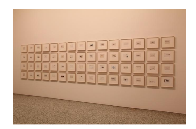
Bridges installation view, Venice Biennale 2011

Three postcards from the series were purchased by the British Council in 2011.