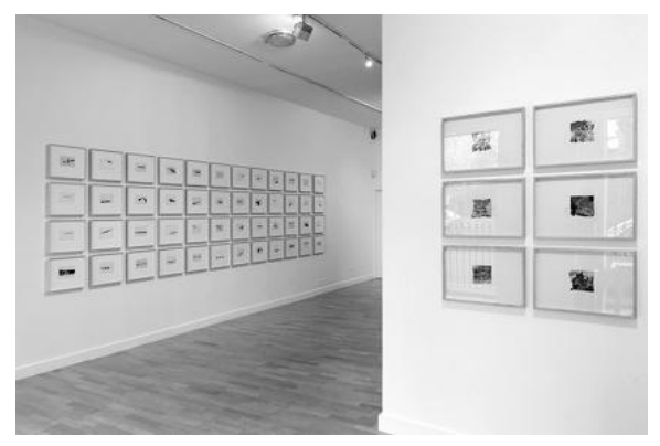
Bridges installation view, Fold Gallery, London, 2012