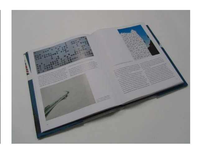
Bridges featured in Cooper, J. (2012) Artist's postcards: A Compendium. London: Reaktion Books