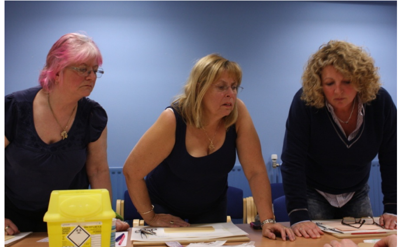
Nipple reconstruction textile workshop